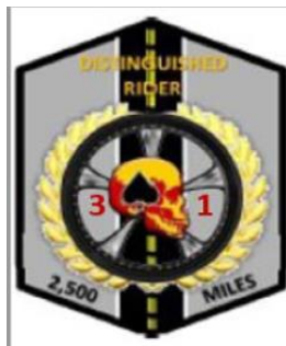
Distinguished Rider Program (Initial) Patch