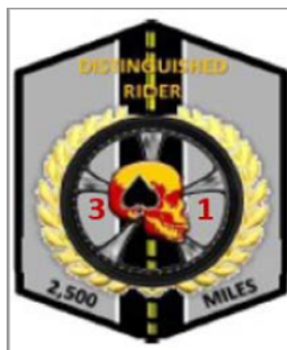
Distinguished Rider Program (Initial) Patch